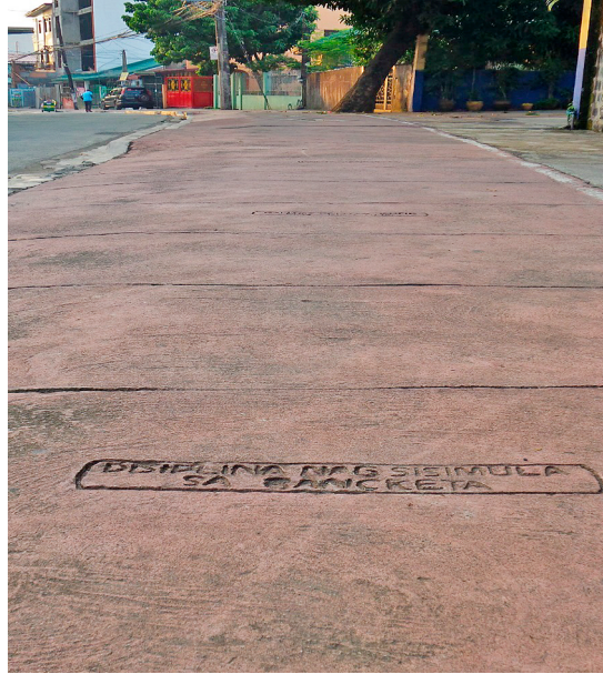
Fig. 2 Sidewalks Are Marked with Reminders or Edicts in the Form of Slogans.

While other cities abroad may have used this strategy, it was a novel idea in the Philippines. Not only were the messages original and innovative, they also reminded citizens that the government was always present and watching. As people walked past these messages, the messages became part of their subconscious, reminding them of the city's rules and edicts. Most important, Bayani was able to convey that there was a public space where there were rules and norms and that public facilities built by the city government were public goods. They were not for individual use but for the common good.