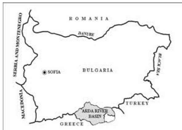
Fig. 1. Map of Bulgaria and Location of Arda River Basin.

Apparently, disaster risk processes occur and develop in varied ways depending on the state of social, eco and geosystem components. Thus, an essential step to explore risk evidence is to construct a model considering cause-effect relationships and interactions between the latter.