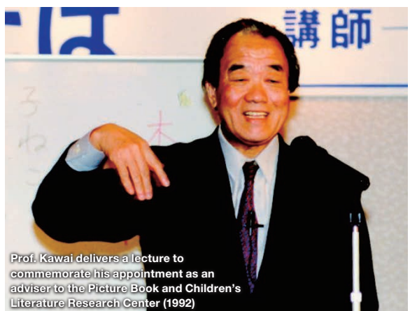
Prof. Kawai delivers a lecture to commemorate his appointment as an adviser to the Picture Book and Children's Literature Research Center (1992)

Kawai's intention was not to simply introduce Western psychology to Japan, as he did by introducing techniques such as sandplay therapy. His personal experience gave him a keen understanding of the cultural and psychological differences between Westerners and Japanese, and he believed that western clinical psychology and psychotherapy, which were based on explicitly on verbal expressions, could not be effectively applied to Japanese people without modification. He therefore aimed to develop a form of psychology