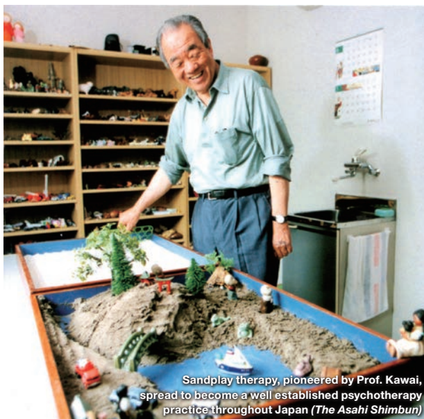
Sandplay therapy, pioneered by Prof. Kawai, spread to become a well established psychotherapy practice throughout Japan

As he had anticipated, hakoniwa therapy was very well received, and sandplay therapy has now spread and become an established psychotherapy practice in Japan. This is evidenced by the fact that the Japan Association of Sandplay Therapy now has over 2000 members. The practice has continued to progress steadily, and the accumulated study results produced by Japanese sandplay therapy have garnered international praise. Honoring Japan's contribution to the development of sandplay therapy, Dora M. Kalf, who was the inventor of the technique, even suggested that hakoniwa be adopted as its international name.