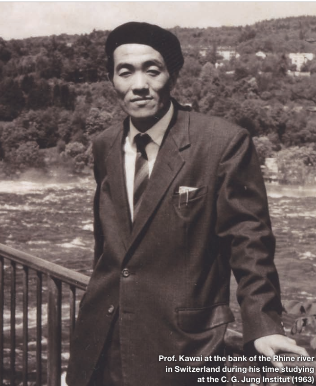
Prof. Kawai at the bank of the Rhine river in Switzerland during his time studying at the C. G. Jung Institut (1963)

At the beginning of his academic career, Kawai studied mathematics in Kyoto University's Faculty of Science. He soon realized, however, that he was not cut out for a scholarly career in mathematics, and, as he enjoyed teaching children, he decided instead to teach mathematics as a subject in high school. Through counseling his students as a high-school teacher, he began to realize his interest in learning about human beings. This led him to take up the study of psychology while maintaining his career as a high-school teacher. At that time, the field of psychology was focused on experimental or behavioral psychology, and placed much weight on objective data obtained by