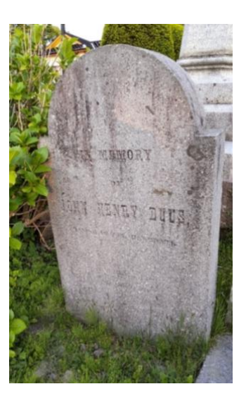
Figure 3 – Duus' heavily worn gravestone in Hakodate's Foreign Cemetery.

Duus himself died following a stroke on 7 April 1889 aged 55. A small notice of his death in the English language treaty port newspaper the Japan Weekly Mail described him as "a genial and kind hearted man [...] known and liked by almost all foreigners in Japan." It also noted that Duus had "found fortune very unkind, especially in his latter days." The Japanese language newspaper Hakodate Shinbun reported on Duus' funeral service, held in the Anglican church in the Motomachi area, in some detail. The attendees of the funeral included the British and Chinese consuls, a handful of foreign residents, the head of the Hakodate court, head of the Hakodate custom house and a handful of local merchants, a group of people that provided a fair reflection of Duus' career. That day the British consulate flew its flag at half-mast in honor of the deceased Danish consul who had first come to Hakodate as a British merchant in 1861. After the ceremony Duus was buried in the foreign cemetery where his gravestone still stands today.