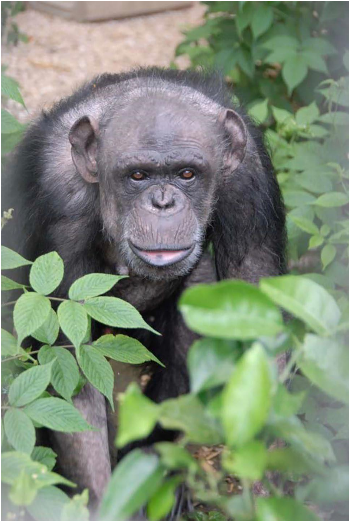
Fig. 1 Candy, outside, seeing the sky for the first time in 30 years