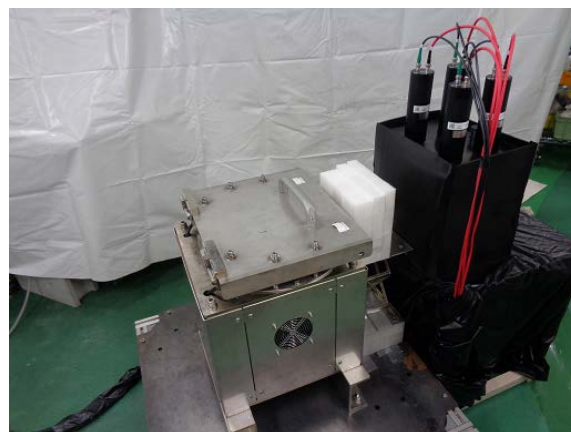
Fig. 1. The rotation machine (left), the water Cherenkov detector (right), and measurement object containing HEU (middle).

RESULTS: Figure 2 shows an example of experimental results of the HEU sample when the rotation speed is 4000 rpm. The measurement time for the experiment was 10 minutes. A comparison between the time-distribution spectra at 4000 rpm and 300 rpm reveals that the integrated value after the center (around 6000 micro-seconds at 4000 rpm) increased only for the HEU sample, but not for a blank sample (sample without nuclear material). Thus, we have successfully detected approximately 4 g of HEU using low-cost non-destructive nuclear material detection system.