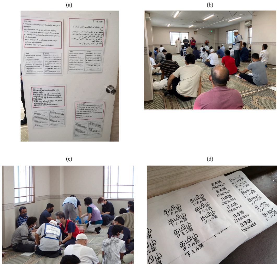
Fig. 3. (a) Multilanguage questions about vaccination precautions posted at the reception; (b) interpretation in front of all recipients; (c) interpretation beside a doctor (the interpreter wore a blue scrimmage vest, and the doctor wore the red); (d) multilanguage stickers to be put on vaccine recipients.

spaces and flow lines according to gender was favorably received by the respondents. When asked if they knew that the vaccine was halal, most of the respondents answered, “Yes, I knew” or “I did not care.” Some said, “I wished to be vaccinated anyhow,” and “Getting the vaccine was most important.” We did not confirm the issue of halal as a barrier to vaccination in these women.