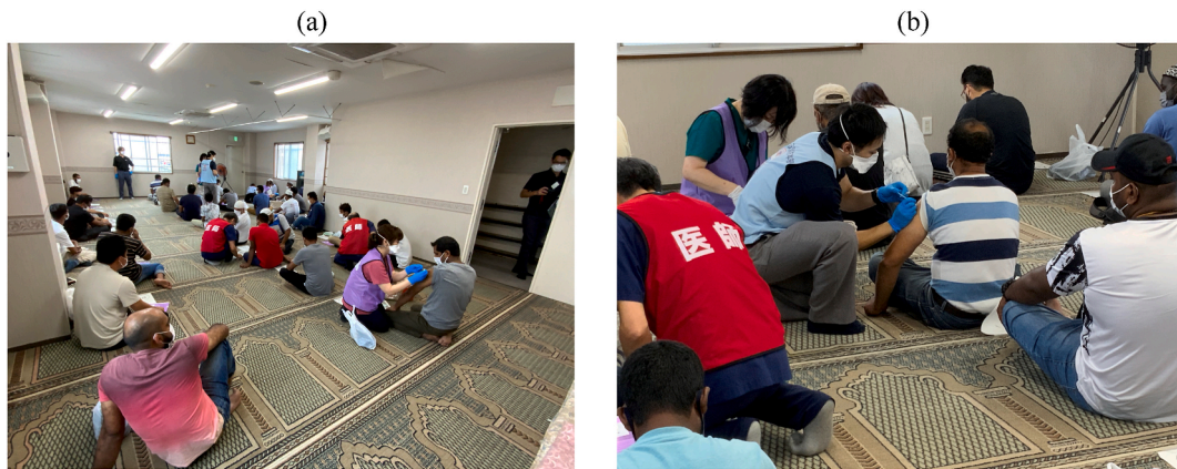
Fig. 2. (a) Vaccination site at the 3rd floor used only for men; (b) vaccinated by a paramedic (the paramedic wore a sky blue scrimmage vest).