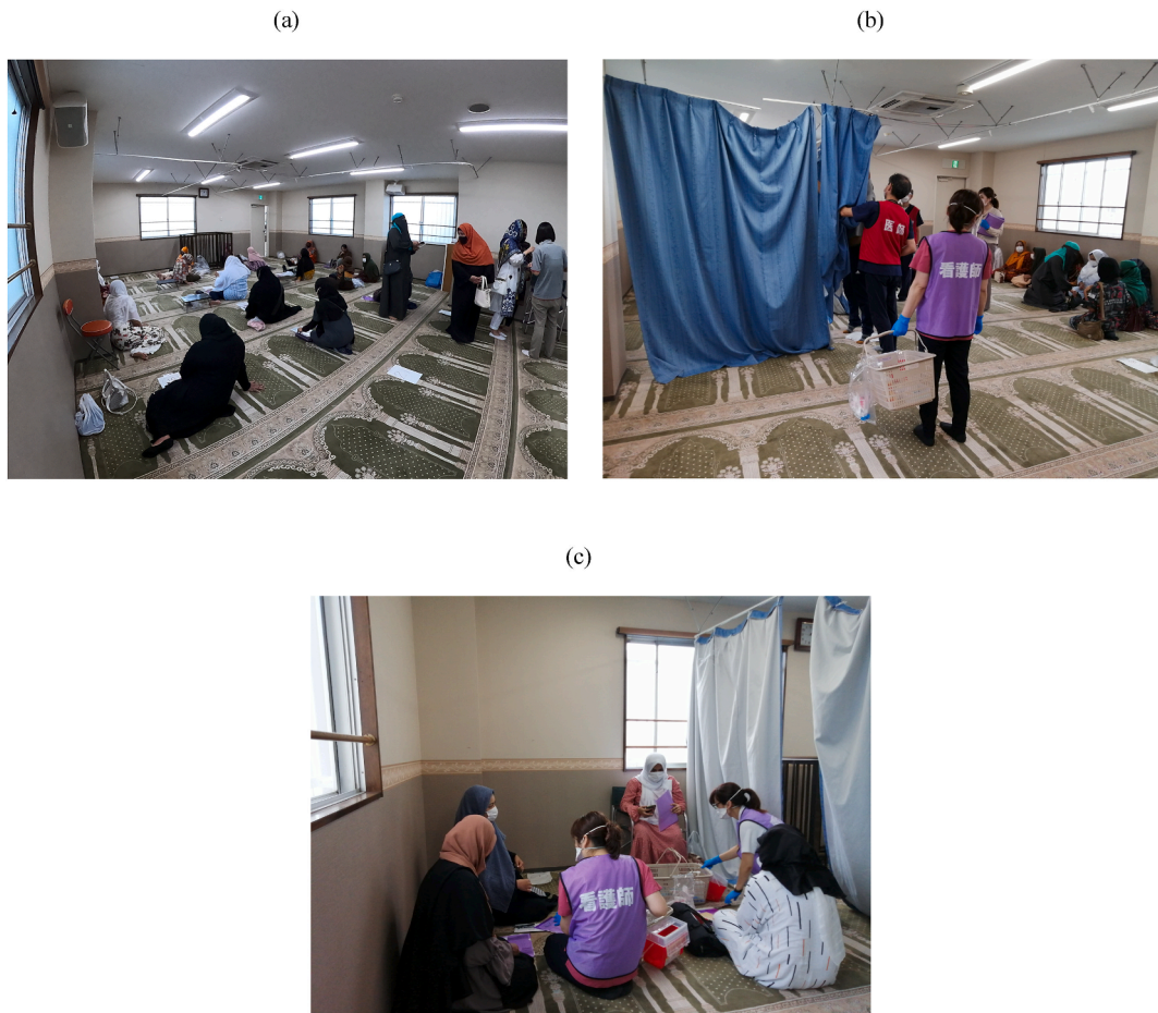
Fig. 4. (a) 2nd floor used for only females; (b) curtain to separate males and females; (c) female recipients vaccinated by female nurses in a separate space (the nurses wore purple scrimmage vests).