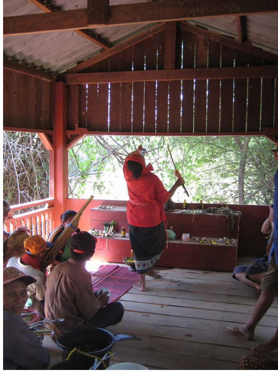
Fig. 4 Spirit Medium at Nakasang Village Dancing in the Ta Ho , with Musicians to the Left. She Drinks Lao Whiskey from a Bottle as She Dances. May 1, 2017