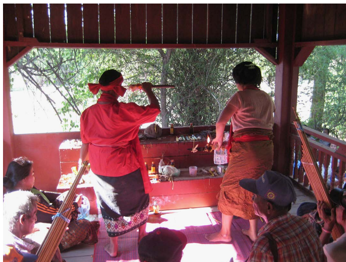
Fig. 5 Two Spirit Mediums Dance in the Ta Ho of Nakasang Village. May 1, 2017