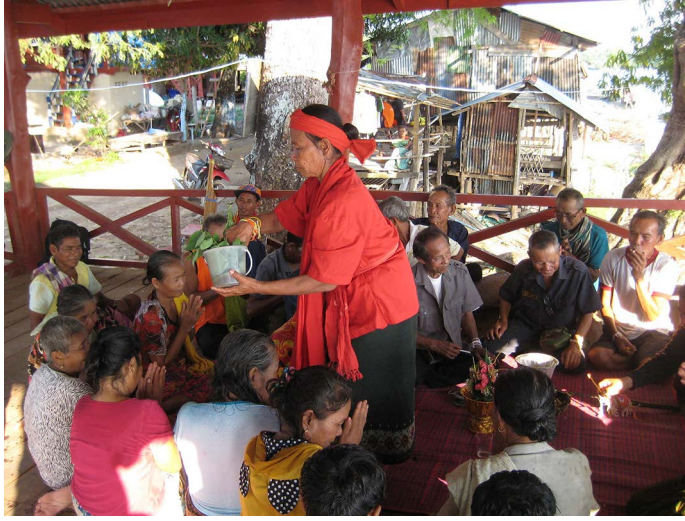
Fig. 7 After Swimming in the Mekong River, the Spirit Medium at Nakasang Village Splashes Holy Water on the Heads of the Accused Phi Pop , Marking the End of the Healing Ritual. May 1, 2017