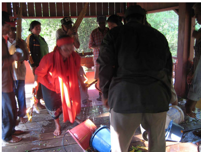
Fig. 6 Spirit Mediums Tip Over Buckets of Fragrant Water in the Ta Ho of Nakasang Village, Wetting the Accused Phi Pop Underneath. May 1, 2017