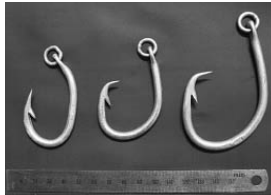
Fig. 1 Fishing hooks of different shape and size. From left to right : 3.8-sun (11.5cm) tuna hook, 4.3-sun (13.0cm) circle hook, 5.5-sun (16.7cm) circle hook.

and billfish) did not differ between the two hook types (Table 2). Kind of fishing baits also affect target selectivity. Our field experiments showed that fish baits had significantly lower catch rate of sea turtles than squid baits. We also conducted captive experiments about hooking mechanisms. In the experiment, sea turtles were likely to swallow the