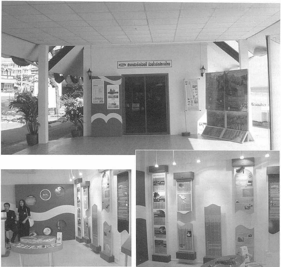
Fig. 5 Position and style of Information charts in the Information Center