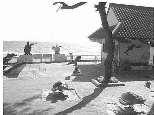
Fig. 3. Location of molded statues in the Information Center

The EMCOR Information Center embodies the interests of the local government of Rayong, non-government organizations, and other concerned citizens to support the National Government in its cause to promote conservation and sustainable use of marine and coastal resources in the country.