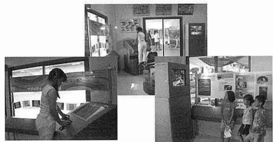
Fig. 4. Location of computer and videos in the Information Center