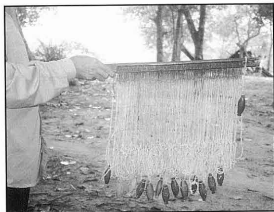
Figure 2: Most threatening fishing gear to sea turtles: the stringray hooks and line current conservation programs

By-catch is another factor that seriously affects marine turtles. In the past, sea turtles caught by accident were released by most of the fishermen, as it was believed that this would bring happiness and good luck. However, currently, releasing of accidentally caught turtles is less frequently done, and mostly it is done by relatively rich people, strong believers, and some conservation agencies. The reason for this is the general decline of marine resources and the increasing poverty in Cambodia, while the black market demand from some