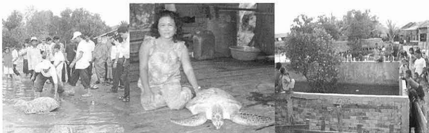
Figure 3 : Caring and releasing activities of local people for sea turtles

Voluntary contribution and collaboration of local stakeholders such as fishermen and navy officers will further ease sea-turtle conservation by providing critical and updated information to the DoF. This will also promote a more decentralized, community-based, conservation scheme. Reporting and communication between local stakeholders and the DoF may be direct or indirect, that is, through diverse locally or regionally based institutions. Unfortunately, the remoteness of some fishermen, with no access to communication facilities, may impede even indirect reporting. However, by setting up a mechanism of indirect communication, by-catches will be more frequently reported to DoF and, therefore, tagging and releasing of sea turtles will be eased in the future. Since the workshop, ten sea turtles have already been successfully tagged and released by the Department. For further improving communication of information relating to sea