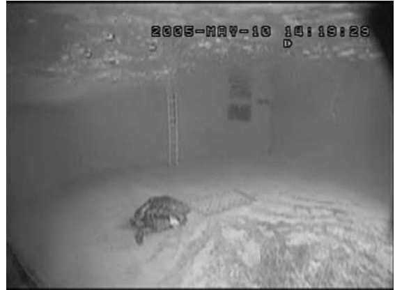
Fig.2. Monitoring graphics of the rearing tank