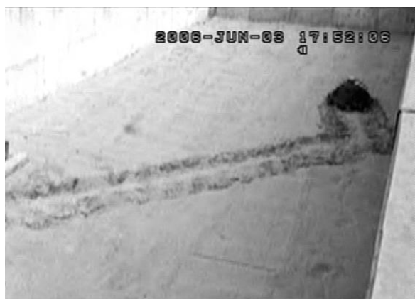
Fig.5. A female turtle searching for a good place for nesting