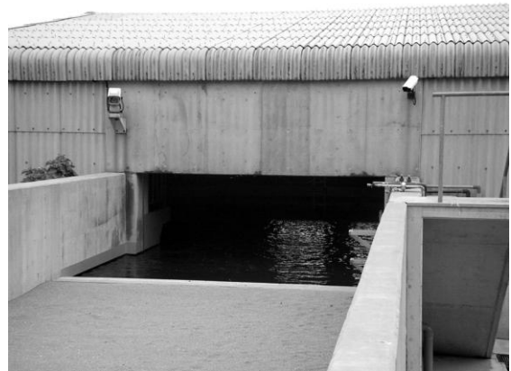
Fig.3. Monitoring cameras which were fixed on the upper side tank wall connected to the nesting bed