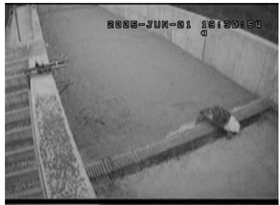
Fig.4. A female turtle ascending to the nesting bed