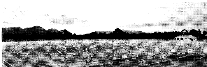
Figure 2: A view of the EAR