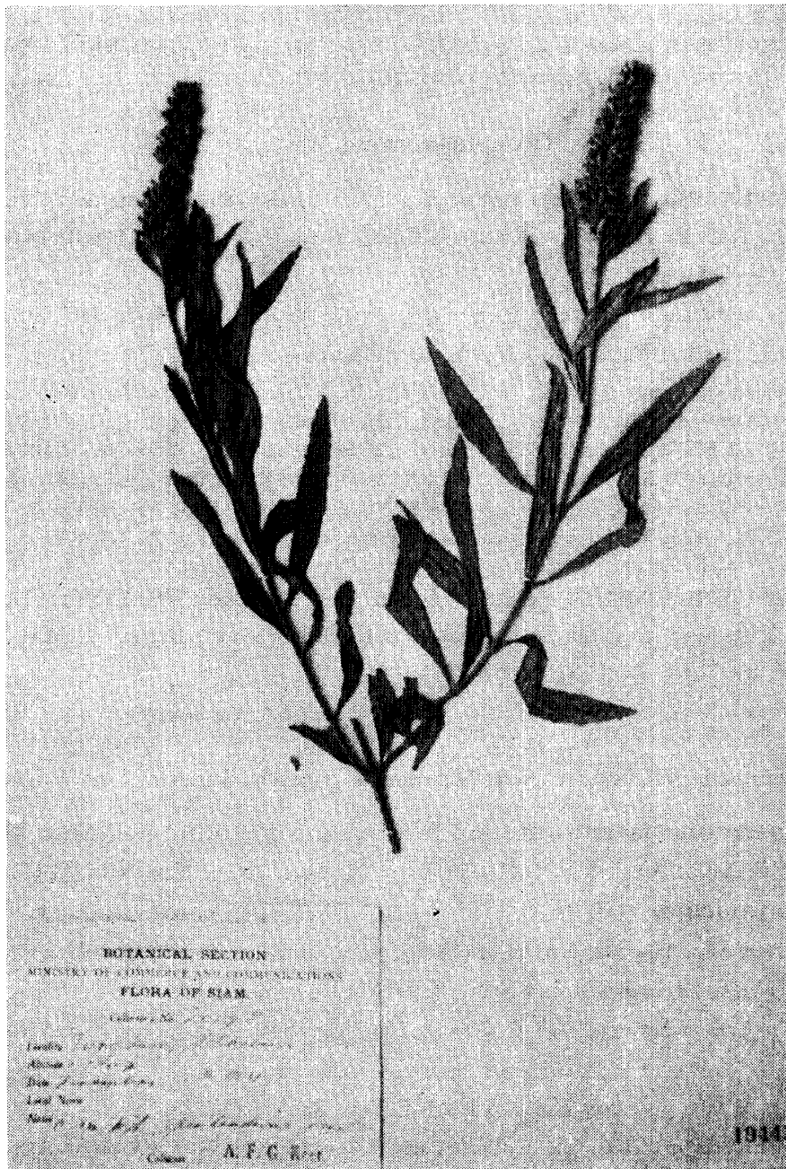
Fig. 1 Type specimen of Geniosporum lanceolatum CHERMSIRIVATHANA