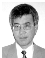
Prof ESAKI, Nobuyoshi (D Agr)

Structure and function of biocatalysts, in particular, pyridoxal enzymes and enzymes acting on xenobiotic compounds, are studied to elucidate the dynamic aspects of the fine mechanism for their catalysis in the light of recent advances in gene technology, protein engineering and crystallography. In addition, the metabolism and biofunction of sulfur, selenium, and some other trace elements are investigated. Development and application of new biomolecular functions of microorganisms are also studied to open the door to new fields of biotechnology. For example, molecular structures and functions of psychrophilic enzymes and their application are under investigation.