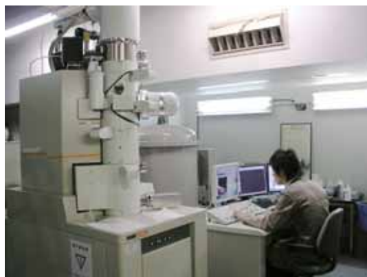
Figure 2. Cryogenic electron spectro-microscope: STEM/TEM, Field emission gun, Liquid He cryo-holder, \Omega -imaging filter, EELS, 2k \times 2k CCD detector.

Koshino M et al. , J. Electron Spectroscopy & Related Phenomena , 135(2-3), 191, (2004).