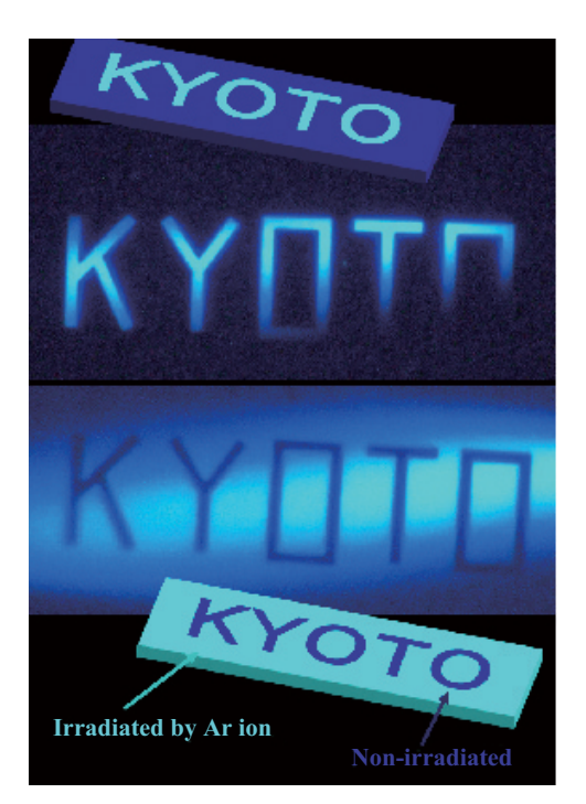
Figure 1. An example of the blue-light emission from a local engineered region of oxygen vacancies in SrTiO<sub>3</sub>.

Oxide-based electronic devices are expected to have fascinating properties, unlike those of conventional semiconductors. Perovskite structure transition-metal oxides are key materials for this new field of electronics. Among them, SrTiO<sub>3</sub> is of particular important from the viewpoints of fundamental solid-state physics, solid-state chemistry and technological applications. We found that Ar+irradiated, metallic SrTiO3 crystal emits 430-nm blue-light at room temperature. The oxygen-deficient metallic SrTiO3 thin films grown under low-oxygen pressure also show the blue-light emission. Therefore we concluded that the Ar+irradiation introduces oxygen deficiencies in the crystal surface, and that the deficiencies generate conduction carriers and play an important role in the emission. A model by which the doped conduction electrons and the exited holes in the in-gap state produce a new radiative process that emits blue light is proposed. It is emphasized that the emitting region could be patterned into any size and shape by the local engineering of the oxygen-deficiency in SrTiO<sub>3</sub>. Shown in Fig.1 are examples of patterned blue-light emission in the form of "KYOTO". By combining conventional photolithography and Ar<sup>+</sup>-milling (irradiation), locally