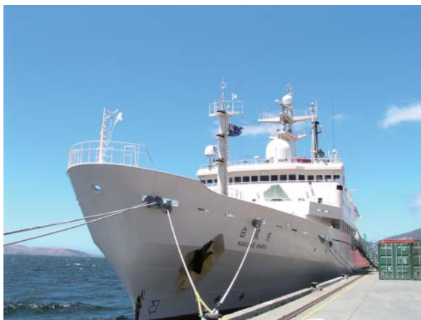
Figure 1. Hakuho-Maru; the research vessel used for the observation during SEEDS I and II.

The equatorial Pacific, the North Pacific and the Southern Ocean are well known as high-nutrient low-chlorophyll (HNLC) regions, where phytoplankton biomass is low ( <1 \mu\text{g Chl } a \text{ l}^{-1} ) despite abundance of macronutrients ( \text{NO}_3^- , \text{PO}_4^{3-} , \text{Si(OH)}_4 ). In most HNLC waters, low concentration of dissolved iron ( <0.22 \mu\text{M} ) was identified, using extremely careful sampling and analytical techniques. Iron has been invoked as a limiting factor to primary production (iron hypothesis) due to its biological requirement, together with light-limitation, grazing effect by zooplankton and water temperature. Recently, the iron hypothesis is evidenced by the fact that a number of mesoscale iron enrichment resulted in a rapid accumulation of phytoplankton biomass. We have been investigated the marine geochemistry of Fe, Co, Ni, Cu, Zn and Cd, which have many implications for phytoplankton's growth and metabolic processes, during the mesoscale iron enrichment in the Subarctic Western North Pacific Gyre (SEEDS I and II: in the cruise of Hakuho-Maru, Fig. 1).