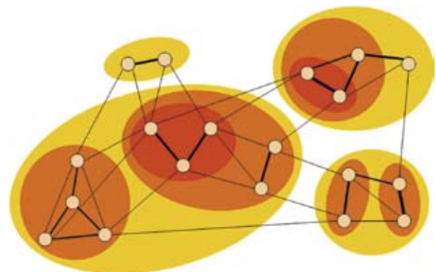
Figure 2. An example of maximal components of a graph.

Hayashida M., Akutsu T., Nagamochi H., Proc. 5th Asia-Pacific Bioinformatics Conference , in press.