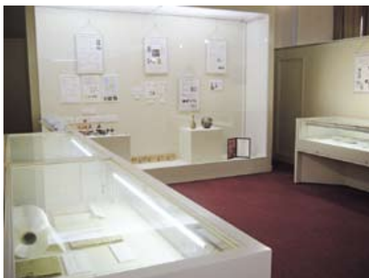
The Historical Exhibition Room

ICR held its historical exhibition from 3 October to 5 November 2006 at the Historical Exhibition Room in the Clock Tower Centennial Hall to commemorate its 80 years of history. The exhibition named “Everlasting Challenge and Innovation”, showed how scientists at ICR had contributed to the development of science and society. The displays contained “Production of the anti-syphilis drug, Saviol,” “Vinyon, the first man-made fiber in Japan,” “World-leading high-resolution imaging by electron microscopy,” “Fine-powdered iron oxides, from practically demanded size and shape control to nanoscience”, and so on. More than 3800 people visited this exhibition during the term, and pictured the historic scenes from the last 80 years.