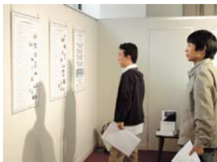
Young scientists are interested in the long history of chemical research.