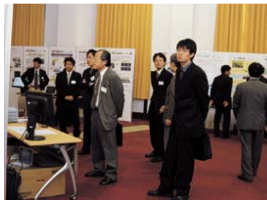
Exhibition of the latest research at ICR

In addition to the historical exhibition, another exhibition was held at International Conference Hall in the Clock Tower Centennial Hall on 2 November 2006 to introduce current activities of our institute. Together with about 50 panels, slides and movies were employed to introduce researches in each division and laboratory vividly. Samples of research instruments and products were also demonstrated. Intellectual Property Department of Kyoto University had an information booth on the patents applied from our Institute.