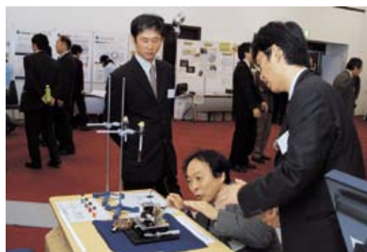
Active discussions are held with interesting demonstrations.