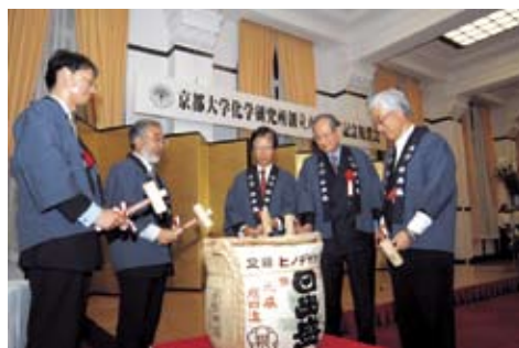
KAGAMIBIRAKI ceremony at the banquet