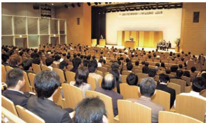
Commemorative Ceremony for 80th Anniversary