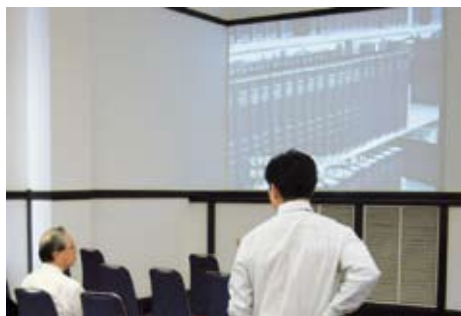
Movies introduced the institute’s history, facilities, and research.