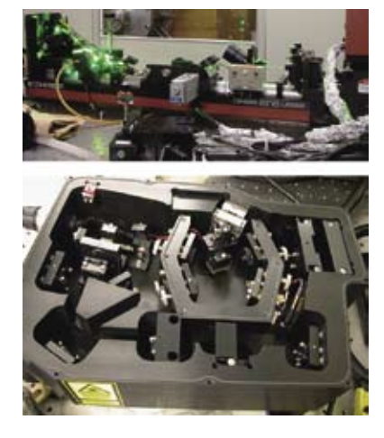
Figure 1. A ring dye laser system (upper picture) and a frequency doubling unit (lower picture).

[1] S. Nakamura et al.: Jpn. J. Appl. Phys. 46 (2007) L717.