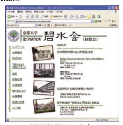
HEKISUIKAI website (http://www.kuicr.kyoto-u.ac.jp/ hekisuikai/)