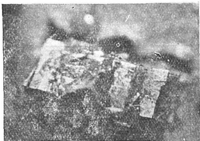
Fig. 3. Natural size.

the fracture planes were parallel to (100) or (112) (Fig. 3).