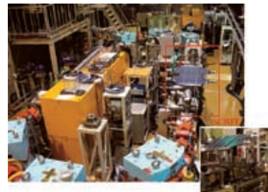
Figure 3. An overall view of an electron storage ring, KSR, where the SCRIT is installed.

With the use of an electron storage ring, KSR, the studies of the structure of nucleus trapped into an ion trap: SCRIT (Self-Confining Radioactive Isotope Ion Target) set in a straight section of KSR as shown in Figure. 3 has been performed in these a few years by collaboration with a group from RIKEN. Recently the principle of such a scheme to investigate the structure of the nucleus detecting the scattered particles by an electron-nucleus scattering has been successfully demonstrated for stable ions as ^{133}Cs , although the final aim of such a scheme is to be applied for unstable nuclei [2].