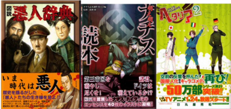
2: Covers of Illustrated Dictionary of Villains, 3: Nazi Reader and 3: Hetaria 2 – Axis Powers.

Himaruya Hidakazu's Hetaria 2 – Axis Powers (Gentōsha, 2008) are books for general reading and, as of 2010, were carried by most bookstores. Images related to Nazi Germany feature prominently on the covers of each manga.