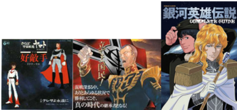
6-8: Covers of Nazi-related animated movies.

In terms of cultural history, the golden age of this “Nazi-Cul” began in 1978 when the record breaking hit movie Farewell to Space-Battleship Yamato – Warriors of Love caused a number of social phenomena.