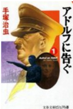
5: Cover of Adolf ni tsugu .